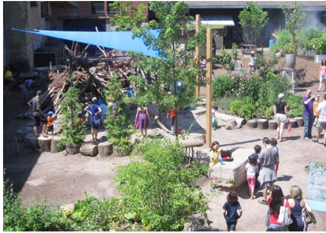
The Children's Garden- Present Day