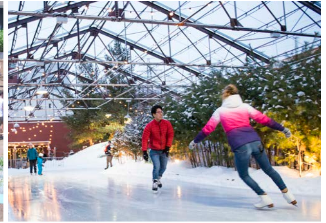
Skating in Koerner Garden- Present Day