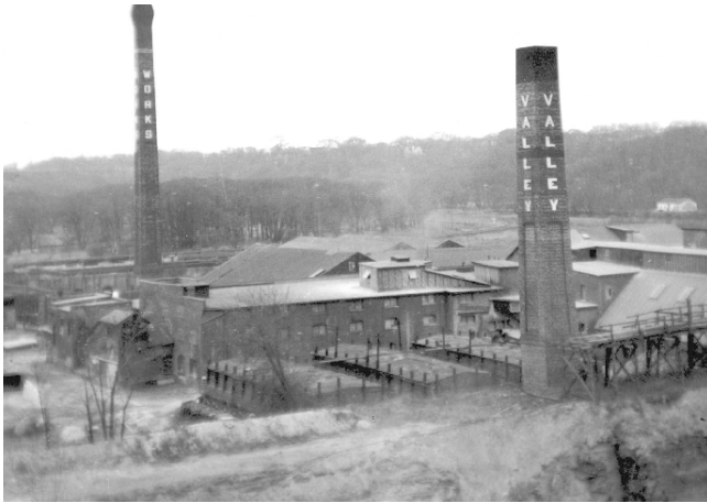
Don Valley Brick Works Todmorden Mills - 1910