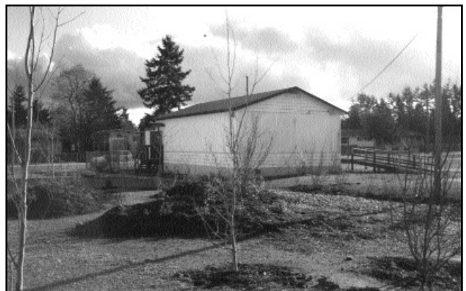
K.B. Woodward Elementary School — AFTER