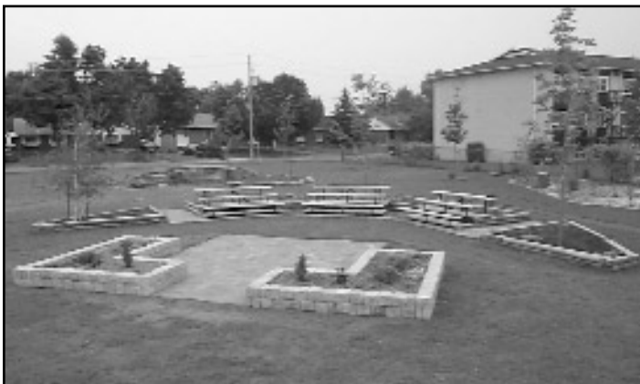
Toniata Public School