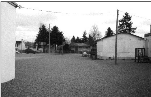
K.B. Woodward Elementary School — BEFORE

The Sto : Lo cultural centre in Sardis was consulted on the design and K.B Woodward staff visited the centre's interpretive Sto : Lo ethnobotanical garden. The final plan included three traditional pit houses buried in the ground in a small circle with sod placed over them to create a natural looking hump in the landscape. The campfires typically found in the pit houses were represented with black granite stones placed in the centre of the pit house. Log benches and boulders were placed around the pit house for seating.