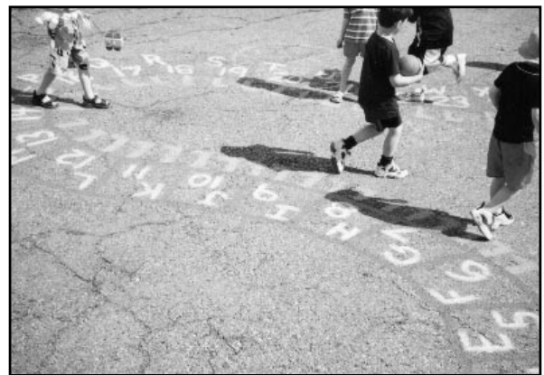
St. Stephen's Elementary School