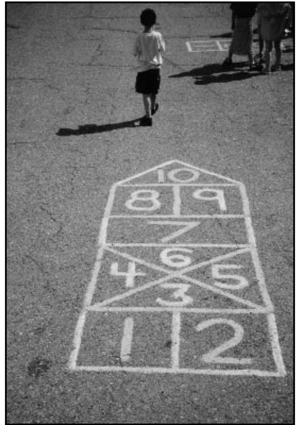
St. Stephen's Elementary School

Paint was supplied by local companies who were approached to donate mis-tints and other leftover paints. Latex paints were chosen for their decreased toxicity and ease of cleanup. Although most of the work was done by parent volunteers, some of the older students participated in the painting. The first applications were done in June of 2000 and the paintings are still as legible as when they were first painted.