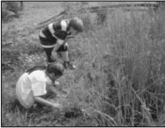
Broadacres Junior School, Etobicoke, Ontario