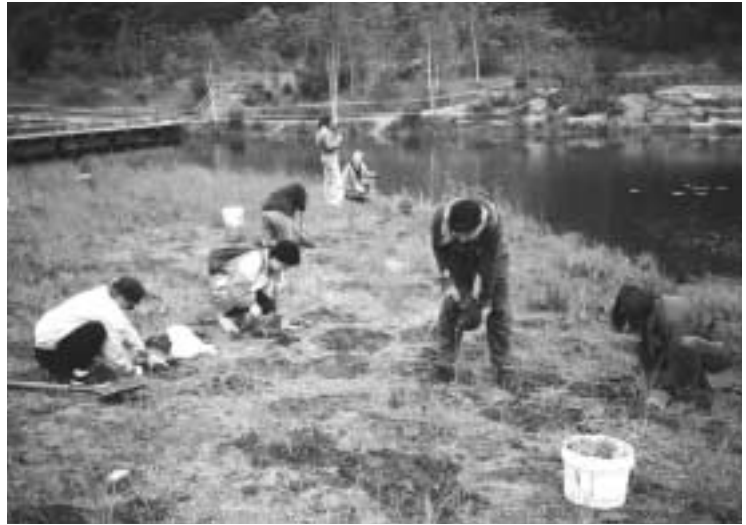
Don Valley Brickworks Wetland Restoration, Toronto, Ontario