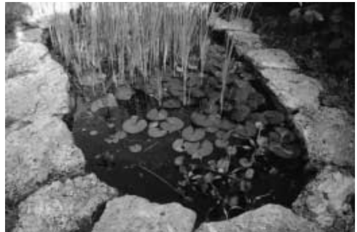
Anson S. Taylor Junior Public School, Toronto, Ontario

You will need to help your pond or wetland achieve nutrient balance until plants are well established. Excess nutrients will be taken up by aquatic plants, but algae are a natural component of wetlands that will form until a natural balance is reached. Algae provide most of the oxygen in your pond and are the most important food source for tadpoles. However, you may need to remove excess algae until plants are large enough to shade the pond and control algae growth. Never use algacides in your pond as they can harm aquatic organisms.