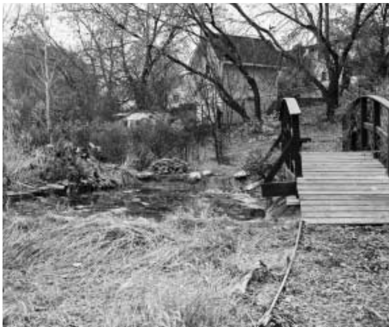
Kawartha Heights Elementary School, Peterborough, Ontario