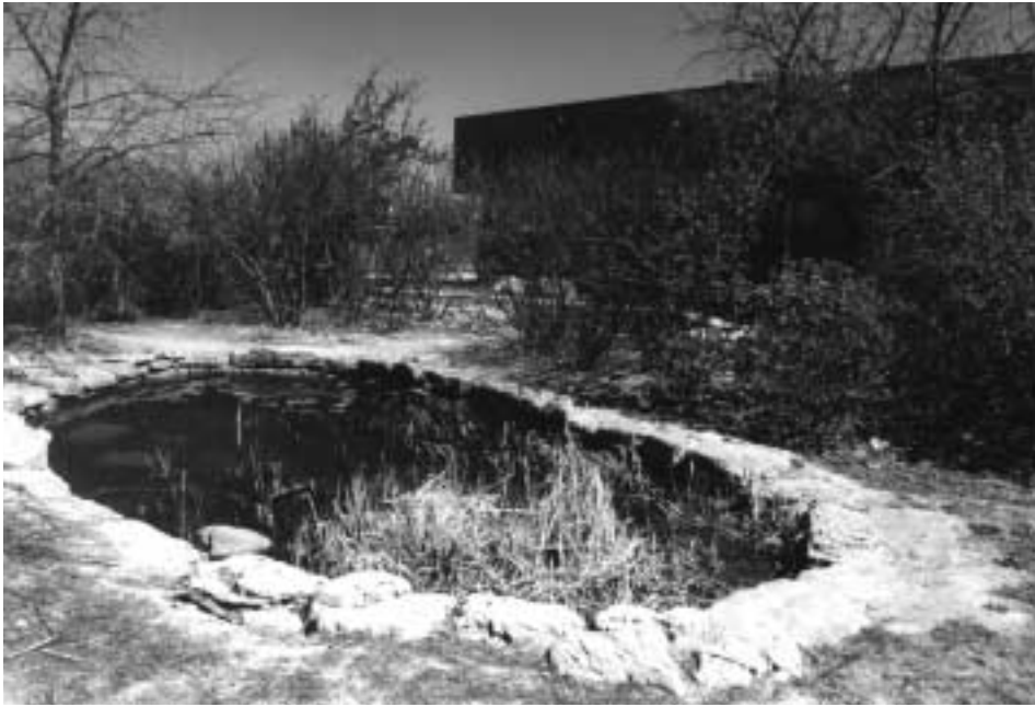
Anson S. Taylor Junior Public School, Toronto, Ontario