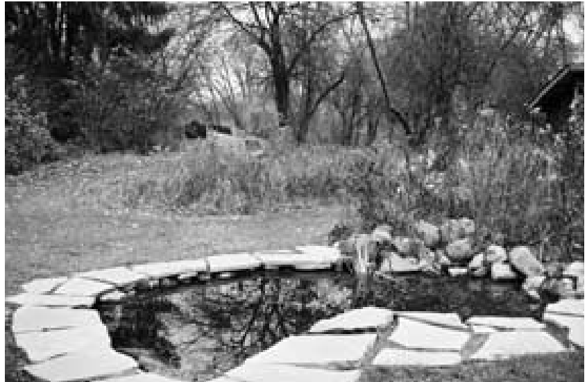
Peterborough Ecology Park, Peterborough, Ontario

For existing wet areas like ditches and depressions all you may need to do is stop mowing and let naturally occurring wetland species begin to emerge and establish. Once the area becomes established you can add other native wetland species that will thrive in the area as well as upland species and begin to enlarge your mini-wetland ecosystem.